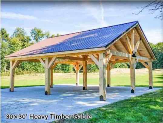
30x30' Heavy Timber Gable

Our Heavy Timber packages bring more strength and versatility to our standard Timber Frame Pavilion design. We've beefed up the sizes of our posts, beams and rafters to allow for even greater durability and a balanced look on large structures.