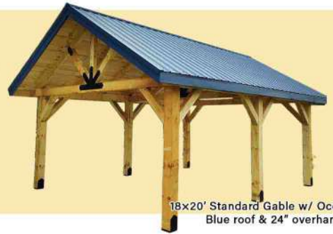
18x20' Standard Gable w/ Ocean Blue roof & 24" overhangs.