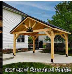
16x16x10' Standard Gable