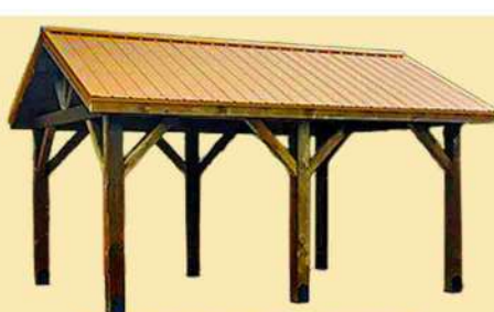
14x20' Standard Gable w/ Copper roof.