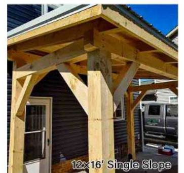
12x16' Single Slope

You won't find any robots or assembly lines in our shop. Every piece of locally-sourced Eastern White Pine used in our structures passes through our hands multiple times. Combining traditional techniques and modern innovation allows us to offer our customers, whether private or commercial, structures that stand the test of time, in terms of both durability and aesthetics.