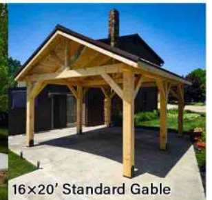
16x20' Standard Gable