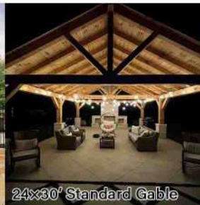
24x30' Standard Gable