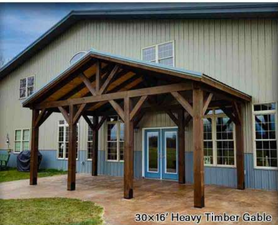
30x16' Heavy Timber Gable