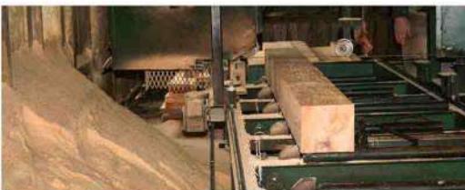
The lumber mill