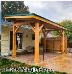
10x16' Single Slope