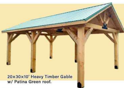
20x30x10' Heavy Timber Gable w/ Patina Green roof.