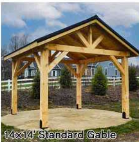
14x14' Standard Gable