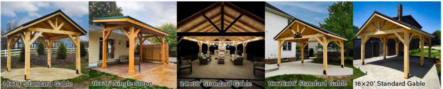
14x14' Standard Gable