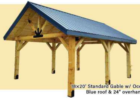
18x20' Standard Gable w/ Ocean Blue roof & 24" overhangs.