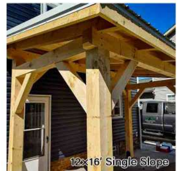
12x16' Single Slope

You won't find any robots or assembly lines in our shop. Every piece of locally-sourced Eastern White Pine used in our structures passes through our hands multiple times. Combining traditional techniques and modern innovation allows us to offer our customers, whether private or commercial, structures that stand the test of time, in terms of both durability and aesthetics.