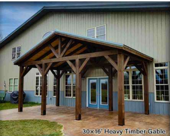
30x16' Heavy Timber Gable

info@northwoodscabinco.com Address: 15339 Kinsman Rd. Middlefield, OH 44062 (216) 538-1635